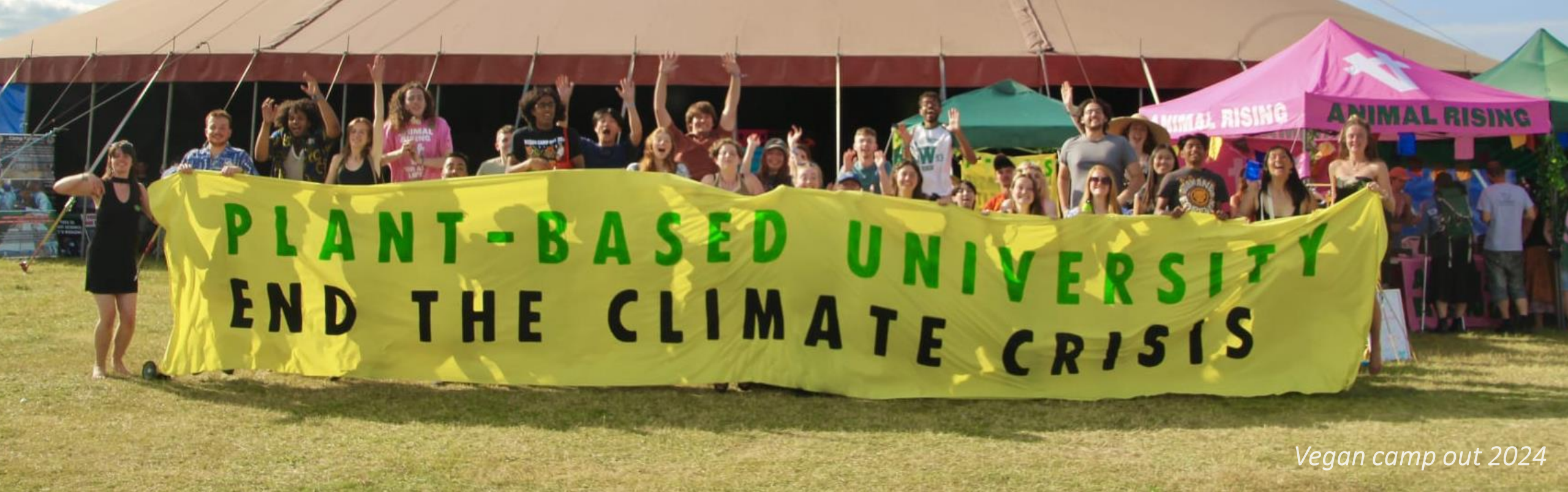
Vegan camp out 2024